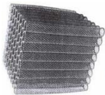
BIO-BLOK® 80 HD G